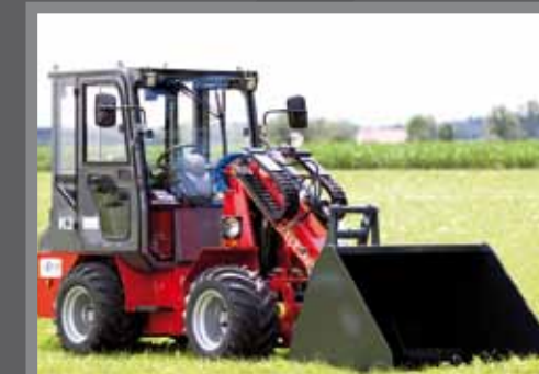
For working outdoors and optimized security the K3 is also available with a comfort cabin.