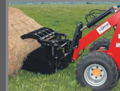
Thanks to the tool holding fixture, which meets the DGS Euro standard, commercially available tools can be used.